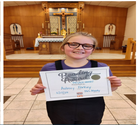
Evelyn read 200,000 words. Grayson read 600,000 words. Aubrey read 700,000 words.