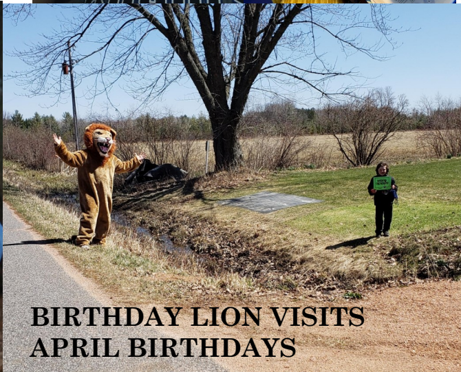
BIRTHDAY LION VISITS APRIL BIRTHDAYS